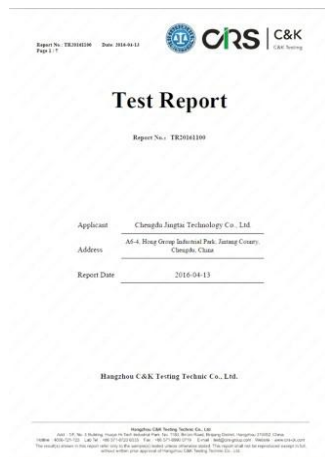
ROHS Testing Report