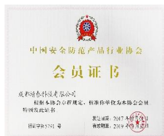
Member of China association of safety and preventive products