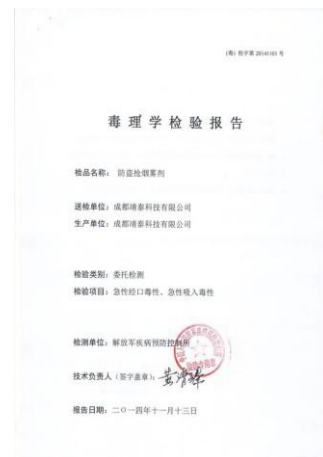
Toxicological examination report of the PLA institute of disease control and prevention.