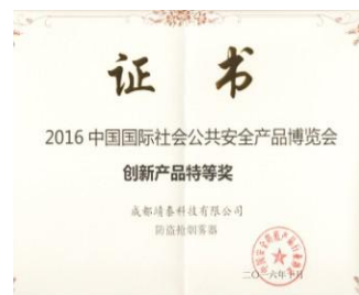
The Grand Prize Certificate Of Innovative Security Product In China International Exhibition On Public Safety And Security 2016.