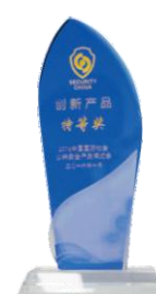
The Grand Prize Medal Of Innovative Security Product In China International Exhibition On Public Safety And Security 2016.