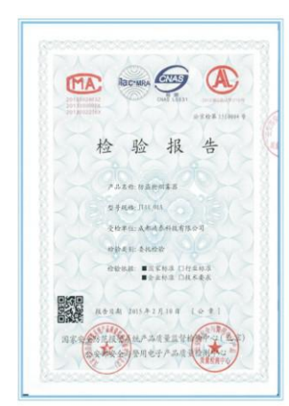
Ministry of Public Security testing report